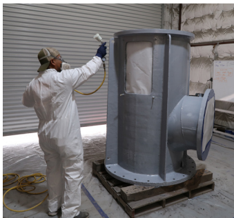
HPLV gravity feed spray