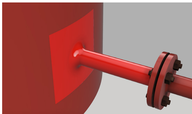
Top coated with Belzona 5115 Tinted Red