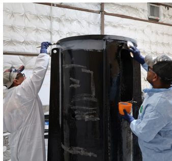
Fine finish paint brush